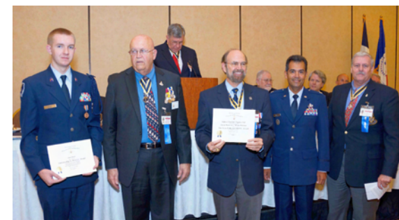
JROTC 2012 TX won National