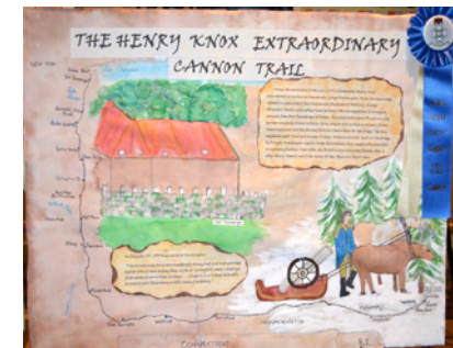
Americanism Poster 2016