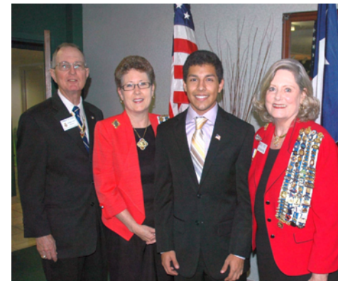
Oration 2013 TX won National