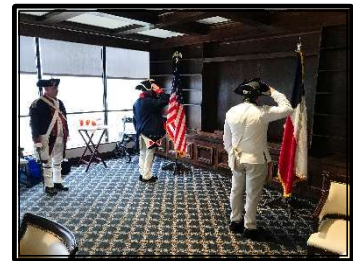
Chapter Meeting – Feb