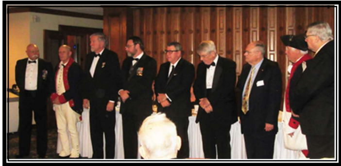
2024 Officers: See web site