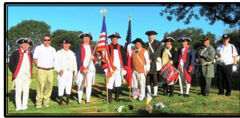
Grave Marking - 2023