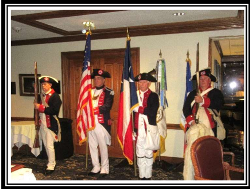
SA Chapter #4 Color Guard