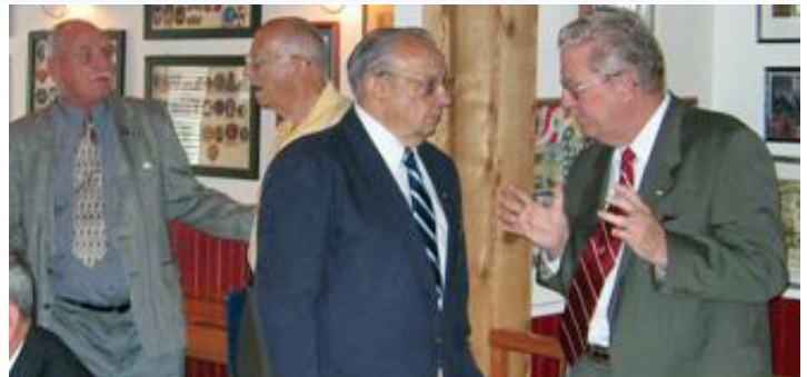
Chapter members engaged in lively discussions prior to lunch at the September general meeting.