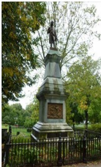
Captors Monument in Tarrytown New York