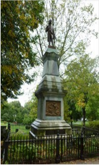
Captors Monument in Tarrytown New York