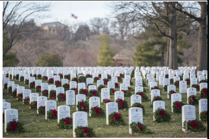
Arlington National Cemetery

The Wreaths Across America organization was established in 2007 whose goal was to place Christmas wreaths on graves in military cemeteries. In December 2008, the U.S. Senate agreed to a resolution that designated December 13, 2008 as Wreaths Across America Day. The affect around the Country has been dramatic with each passing year. The effort began earlier.