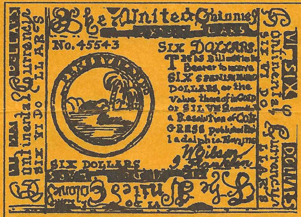
Facsimile of a Continental

During the American Revolution the Continental Congress issued paper money, or bills of credit, to finance the war. The amount of paper money in circulation exceeded the supply of goods and coins backing it, thereby devaluing paper money.