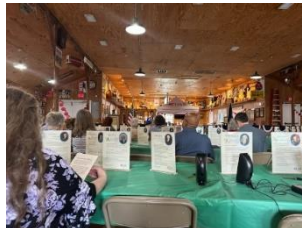
Members solving a trivia challenge before the meeting.