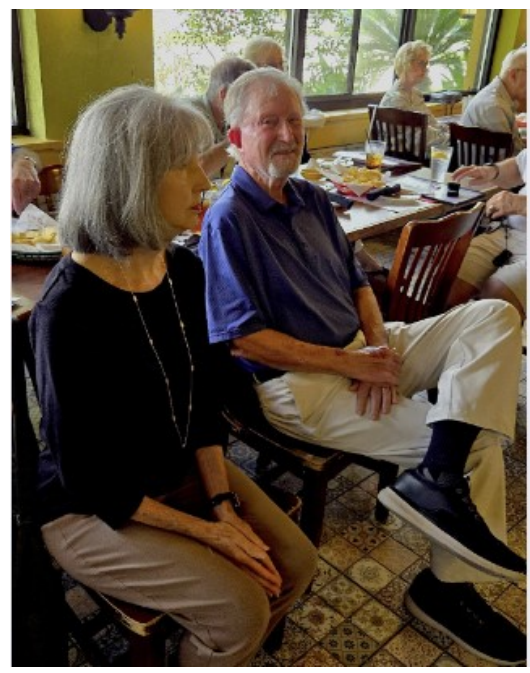
PineShavings 5 October 2024