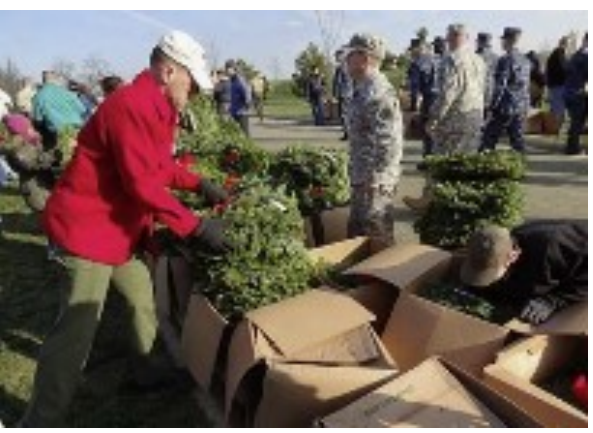
Wreathes Across America