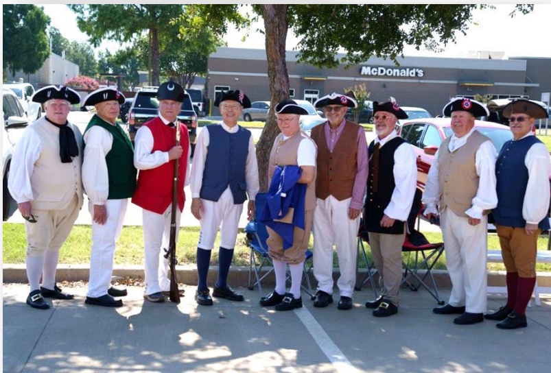
June 15, 2024 Saturday Flag Retirement at Plano Fire Station