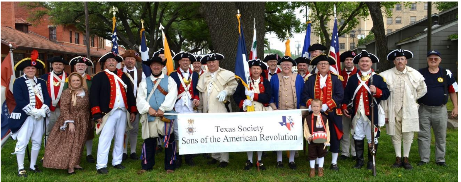
Medal of Honor Parade