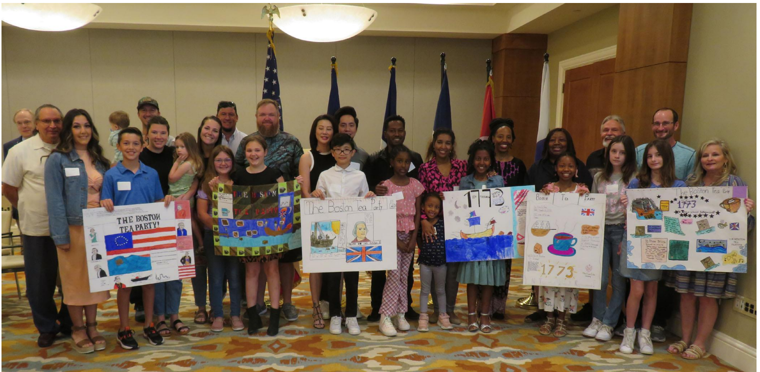
Poster Contest Winners