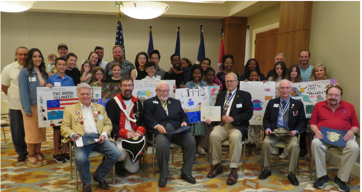
Poster Contest Winners and Chapter Sponsors