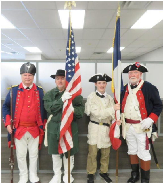
April 28, 2024 Sunday – American Legion The Center 108 E Washington Rockwall

May 16, 2024 Thursday - present the colors at the DART Older Americans Event at Centennial Hall in Fair Park. Muster is at 9:30 AM. The colors will be presented at 9:55 AM - 10:00 AM immediately followed by the National Anthem. We are free to leave after the conclusion of the National Anthem.