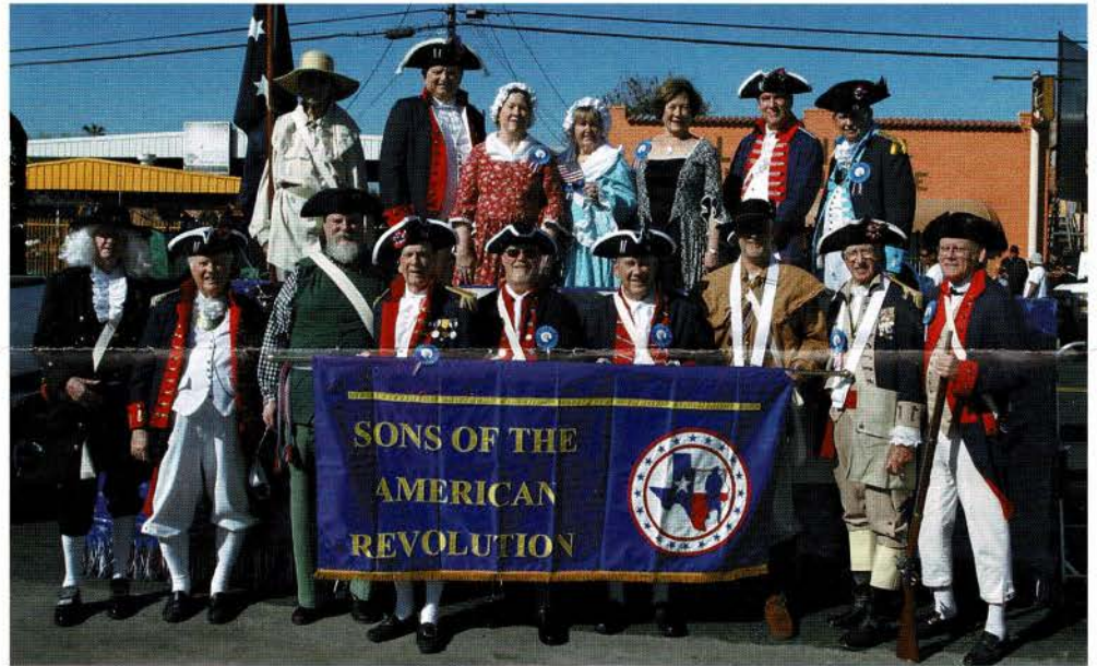
Compatriots from across the state of Texas participated in the annual parade and celebration.