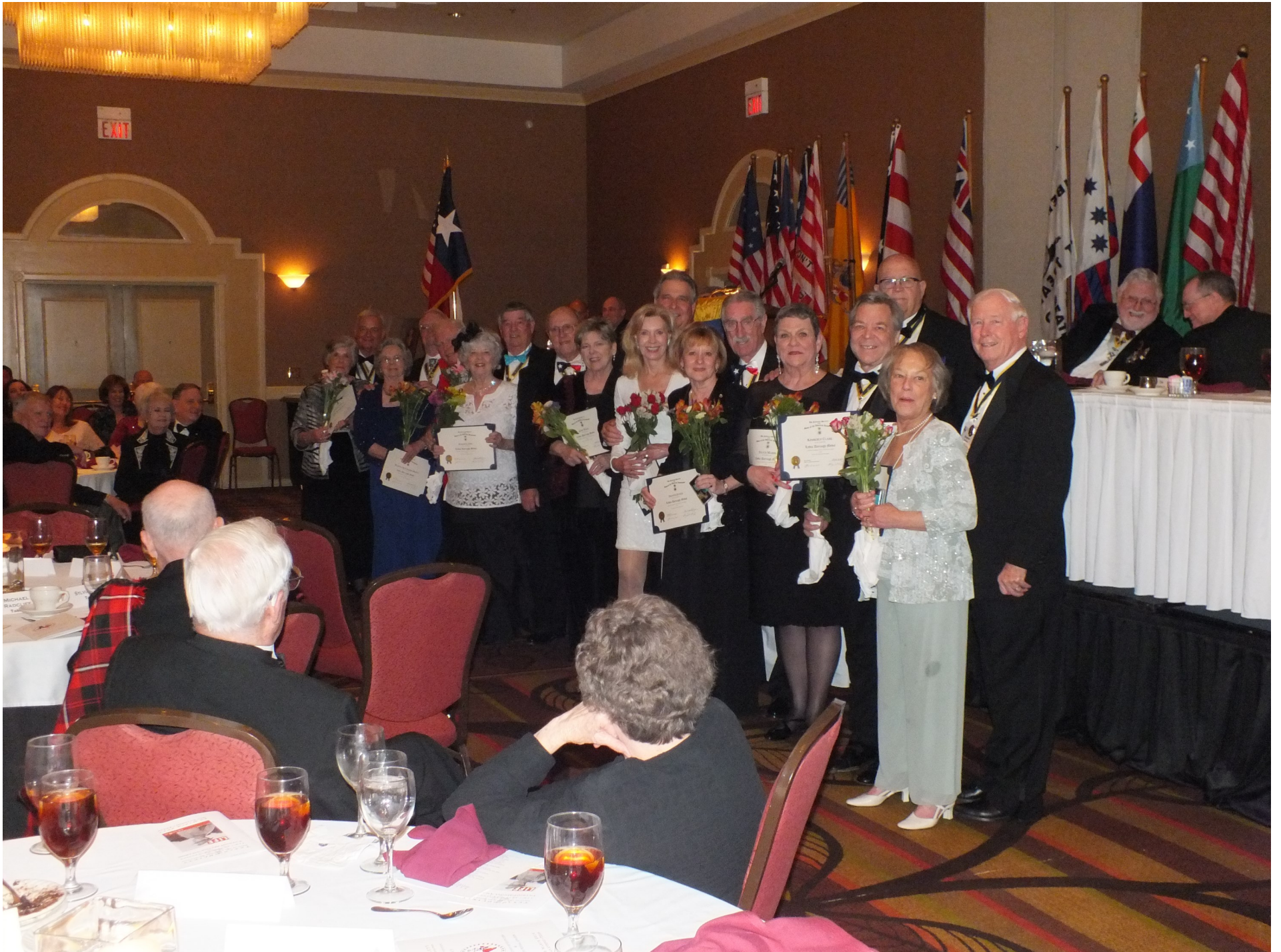
The wives of past Texas SAR Presidents were presented the with the Lydia Darragh Medal