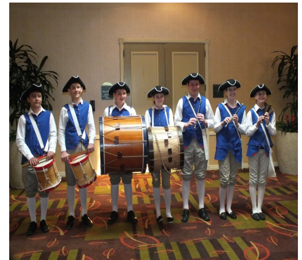
Students from Boerne Middle School North Fife & Drum Corps (the only middle-school fife & drum corps in the Southwest) prepare to perform for guests at the evening banquet.