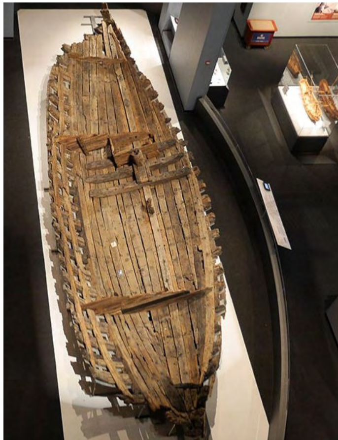
Shipwreck - La Belle

The 17th century French shipwreck La Belle is one of the most significant stories in early Texas history. Explorer René-Robert Cavalier, Sieur de La Salle, set sail for the Mississippi River in 1684 to claim new territory for France. The ship instead sailed into Matagorda Bay, only to sink in 1686. Found 300 years later, an extraordinary excavation and preservation began in 1995. La Belle is the center of the first-floor exhibition "La Belle: The Ship That Changed History."