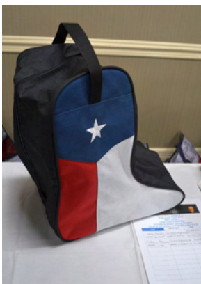
Raffle Items Texas Boot Bag