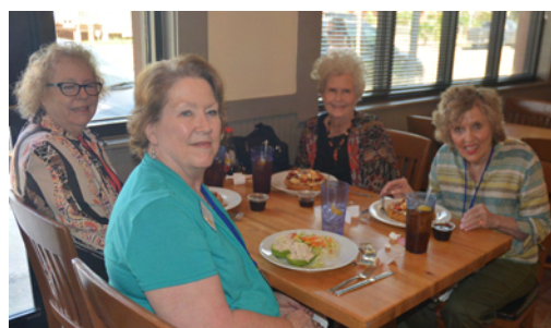
Ladies' Lunch The Sunflower Bakery & Café, 512 14 th Street