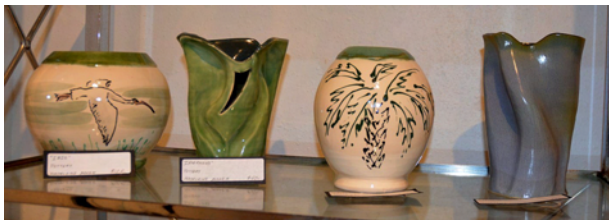
Lunch and Shopping