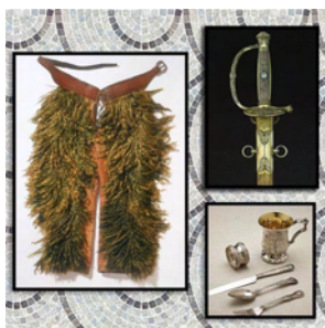
Bryan Museum - largest collection of history and art of the American Southwest

Functional and decorative collection - ancient Native American cultural artifacts to 21st century pieces of exquisite saddles, spurs, antique firearms, exceptionally rare maps and books, fine art, religious and folk art, portraits, and documents.